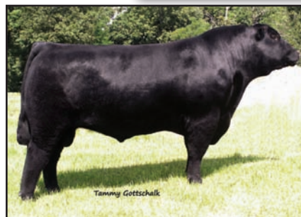
WRL Tracken Norman PCA – 2-Time National Champion Chiangus Bull & Herdsire at Clarahan Farms

biggest concern is when they finally all figure it out that we as Chi breeders have enough bulls to cover demand. What a great problem to have!"