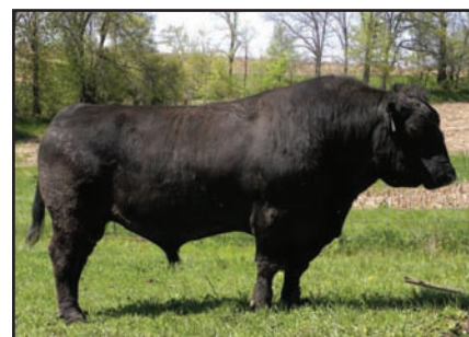
RDD New Direction 1436R 2CA – Herdsire at Clarahan Farms.